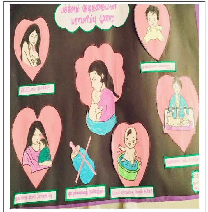
Poster presentation on Mother and Child care